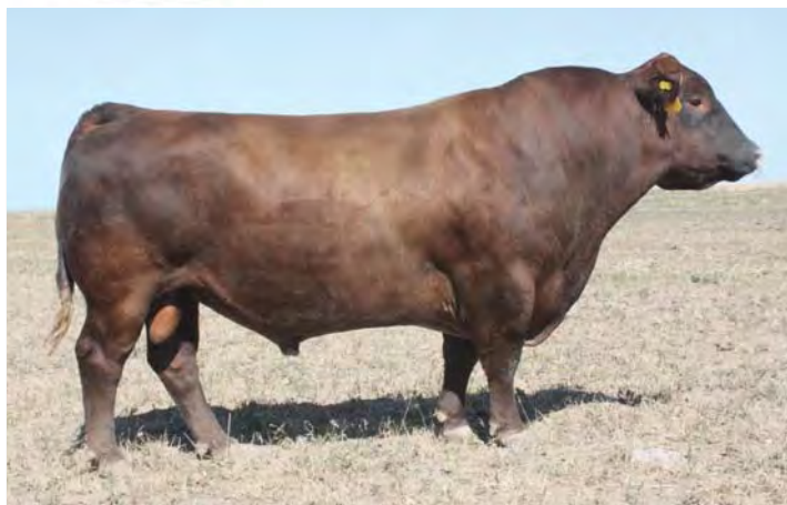
RED CROWFOOT OLE'S OSCAR