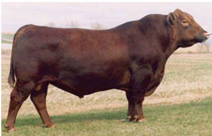
MLK CRK CAPSTONE 901

Mushrush Red Angus purchased this sire and proved him by producing some excellent females that we viewed when we toured their operation.