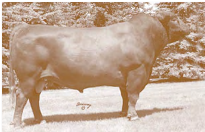
BJR MAKE MY DAY 981

Hobo 79E left us with females that had exceptional udders and style. He currently has seven EPDs in the Top 15%