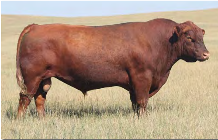
RED CROWFOOT REDMAN 3107A