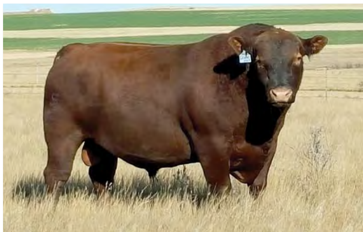
RIDGE LEGEND 2069