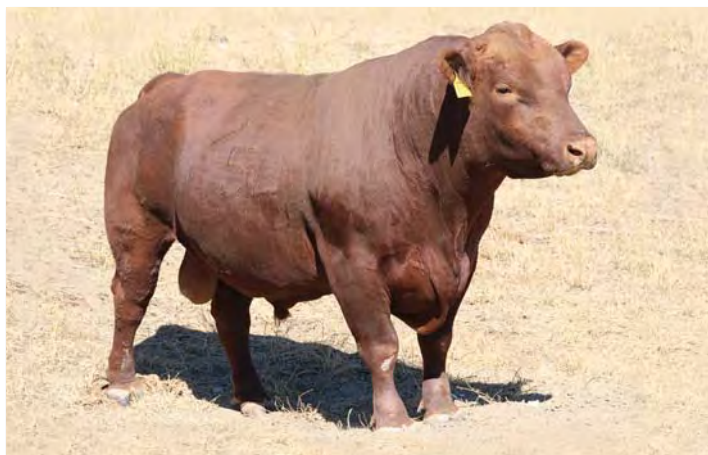
5L FAST BREAK 117-324E