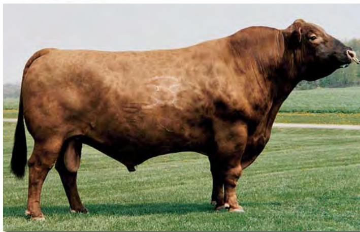
BASIN HOBO 79E