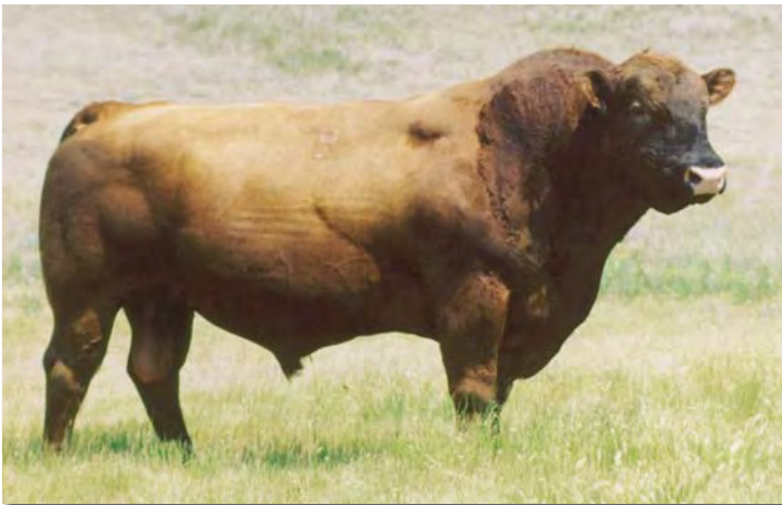
GLACIER CHATEAU 744

Accelerated sire that produced big barreled, great uddered females.