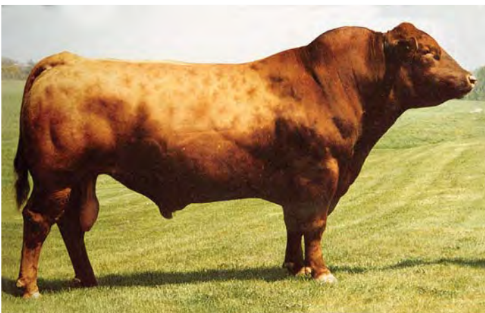
BFCK CHEROKEE CNYN 4912

Popular Genex sire that left his mark on the breed with a current progeny total of 5,877.