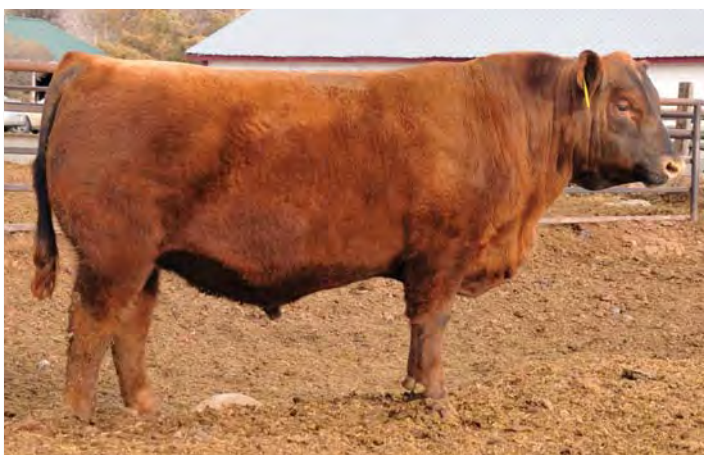
5L THE REAL DEAL 1687-143B

We have calved our third crop of daughters out of 4304 and are very pleased with their fleshing ability, moderate size, feet and leg structure and calving ease. The 4304 daughters are the largest sire group in our cow herd because of the ability of this sire to produce higher performance with good carcass and leave the right size and kind of females in the herd. Progeny and semen available in the sale.