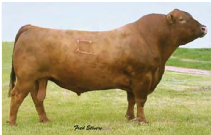
BJR MONU 4X-303

Make My Day produced attractive functional females and was used in many herds throughout the country.