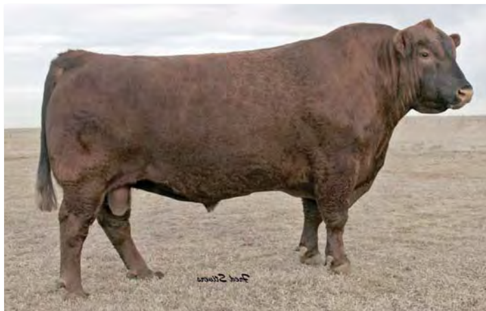
BIEBER MAKE MIMI 7249

King Rob is found throughout numerous pedigrees of the Red Angus database. His influence was based on the thickness and style that he offered the breed at the time he came into popularity. He currently has 6,336 progeny recorded in REDSPro.