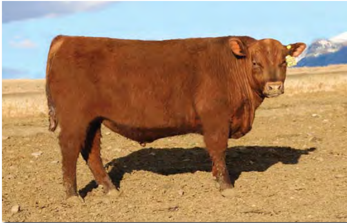
5L VIGILANTE 2674-11D