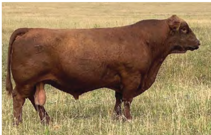
RED MINBURN COPENHAGEN 3Y