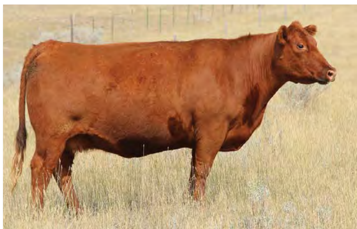
MLK CRK LAKOTA 2115, donor dam of Lots 23A & 23B

Lot 23A is an embryo lot out of a Milk Crk Express 9141 daughter that raised one of the top-selling bulls in our 2020 bull sale going to Bill Lansing of IA. She is an attractive patterned female that does everything right. The sire of this lot is none other than RED Minburn Copenhagen 3Y whose daughters topped the record-setting U2 sale in Canada. The progeny from this mating should be outstanding. Guaranteed one (1) pregnancy if put in by a certified embryo technician. The embryos are in storage at Sleeping Giant Genetics. Shipping is FOB.