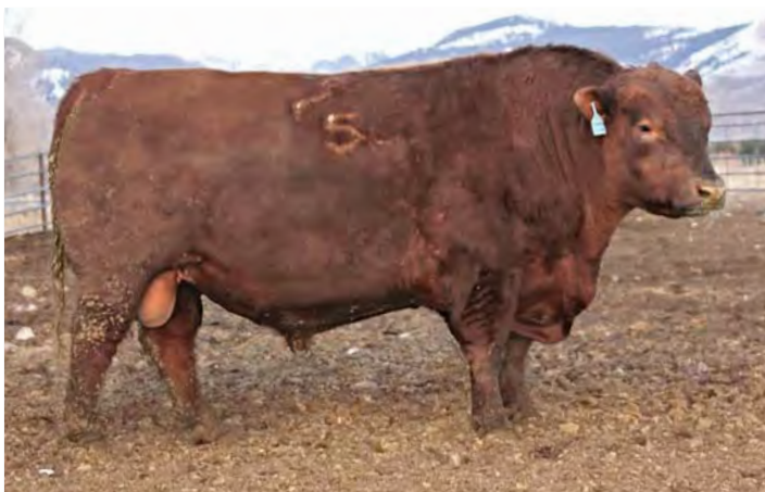
5L BOURNE 117-48A, sire

6120 is a sire that we bought from Heart River Ranch. He is an easy-fleshing, deep-made Advantage son that stamps his progeny with a dark color pattern. His first daughters in production have nice udders and are good footed like their sire.