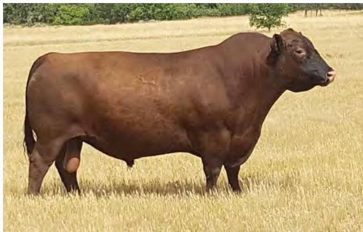
RIDGE ADMIRAL 3411

The 2069 young females in our herd are the reason that we continue to use this sire. They are moderate, dark red and good footed with beautiful udders. We have used him cleanup on heifers for the first three breeding seasons and are using him on cows through A.I. as we sold him as a 5-year-old bull back to Sandbur Ridge Red Angus.