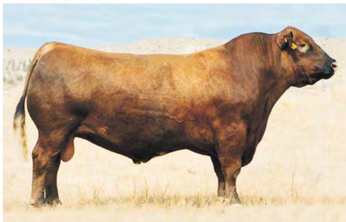
LMAN KING ROB 8621