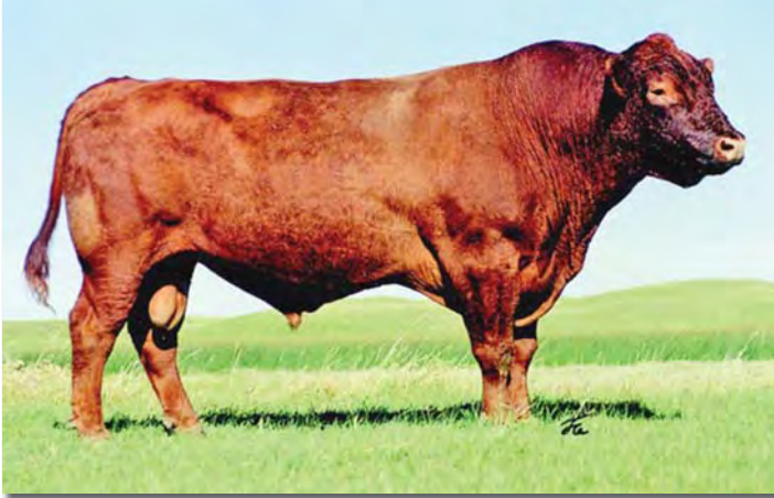
FCC Rambo 502, sire