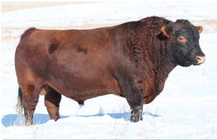
HRR ADVANTAGE 6120

Vigilante is an A.I. sire that we have used the past two years on heifers and cows. The heifers bred to him calved easy and his progeny were above average for weaning and yearling ratios. We really like the moderate frame and shape that he puts in his progeny.