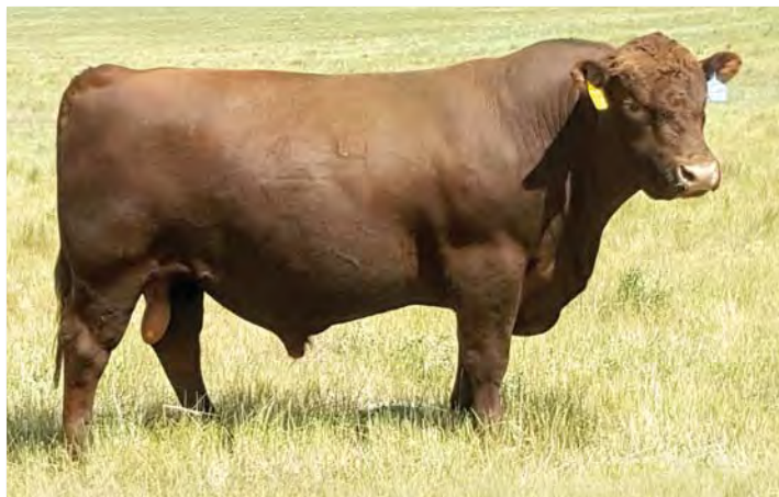
MLK CRK ADVOCATE 4304

ABS sire that left his mark on the breed after being used for many seasons by numerous producers that resulted in 2,879 progeny being recorded in the RAAA database.