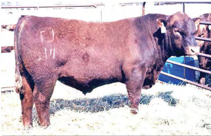
TR JULIAN LT142

Genex sire that came out of the Crowfoot dispersion selling to Ole Farms and Genex.