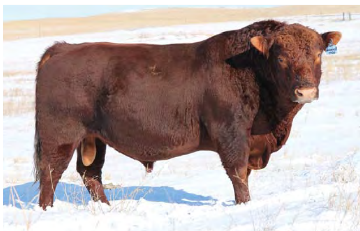
RIDGE PROVISION 6013