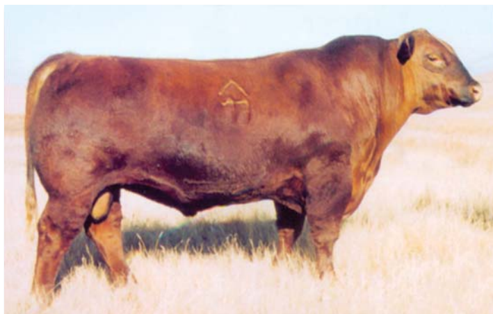
MLK CRK CUB 722

Great female-producing sire that left many breeders with excellent uddered and footed cattle.