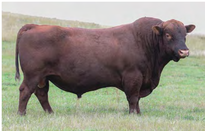
MLK CRK FUSION 5202