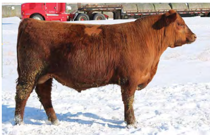
Full Brother to Lot 23B

Lot 23B is represented by a picture of a natural full brother to this mating that sold in our 2020 bull sale to Wind A Near Ranch in Iowa. Sire in Top 5% for BW EPD, Top 12% for CED EPD and Top 11% for Marb EPD. Guaranteed one (1) pregnancy if put in by a certified embryo technician. The embryos are in storage at Sleeping Giant Genetics. Shipping is FOB.