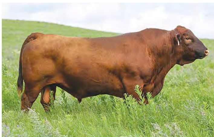
MUSHRUSH IMPACT Z352