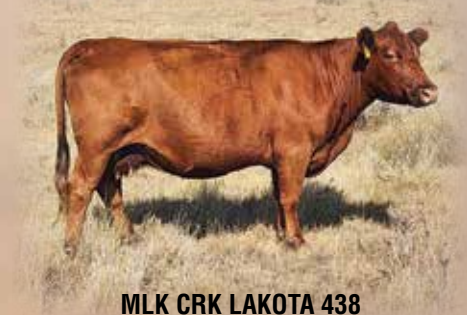
DVAUCTION Broadcasting Real-Time Auctions