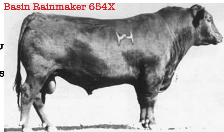
Basin Rainmaker 654X

BASIN RAINMAKER D S 380U BASIN BARDOLINE 423U COLE CREEK OSCAR 92R JUANADA OF ROLLIN ROCK 0355 O C C HEADLINER 661H O C C DIXIE ERICA 946K O C C ANCHOR 711A O C C POLLYANNA 979F