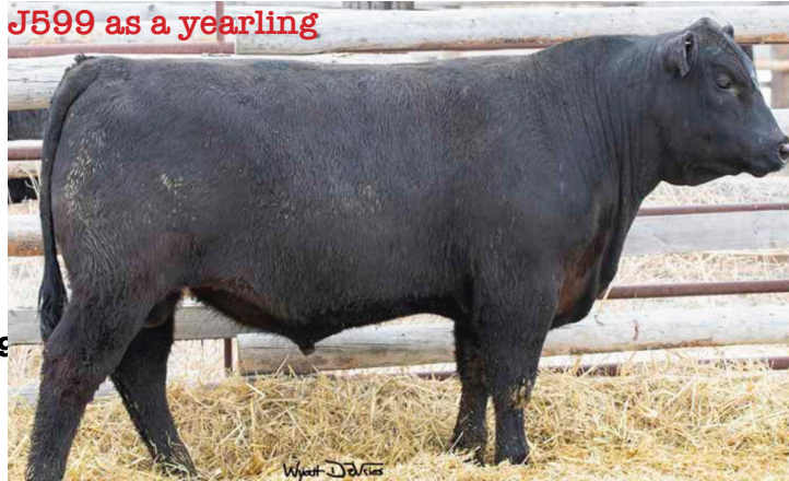
J599 as a yearling

RITO 707 OF IDEAL 3407 S A V BLACKCAP MAY 4136 N BAR EMULATION EXT J BAR 7 ERISKAT Q13-71K1 EMULATION N BAR 5522 N BAR ENCHANTRESS 4908 SINCLAIR PREVIEW 2TL6 SINCLAIR LADY 1FE24 9XT69