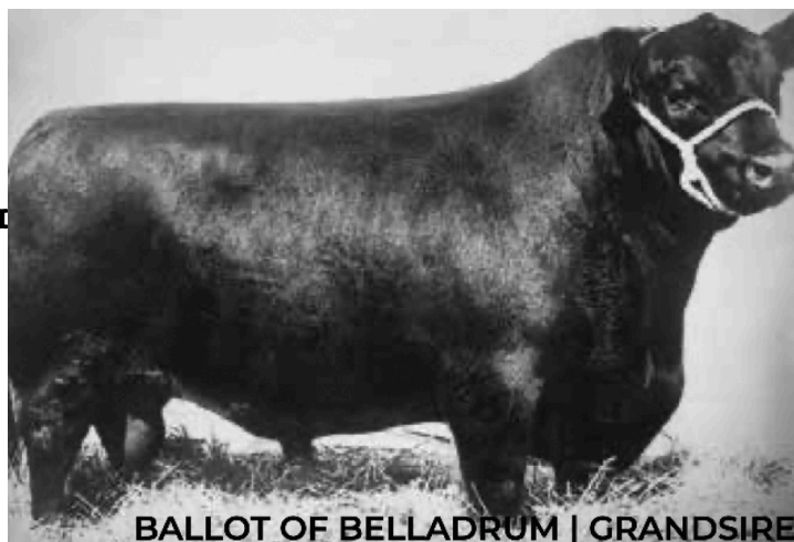
BALLOT OF BELLADRUM | GRANDSIRE

PARAGON OF HAYMOUNT BEDELIA MAID OF BELLADRUM RITO 054 G D A R OCTORARO GAMMER 305 EMULATION 31 ANKONY 8F78 LASS 8F275 Q A S TRAVELER 23-4 C S U MS LANDMARK 4117