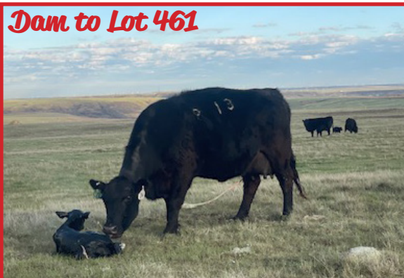
Dam to Lot 461