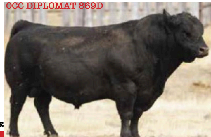
OCC DIPLOMAT 869D

O C C FOCUS 813F O C C BLACKBIRD 736K O C C ANCHOR 771A O C C POLLYANNA 979F D H D TRAVELER 6807 DIXIE ERICA OF C H 1019 O C C ANCHOR 771A O C C REVOLUTION ROSE 751E