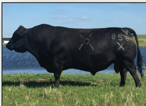
O C C X-CURSION 858X | AAA# 16877227