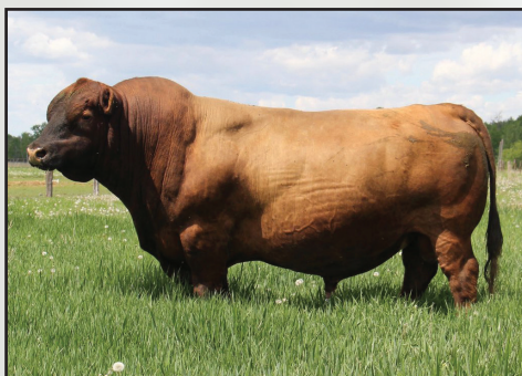
RED OCC EASY RED 868A | RAAA # 3900119