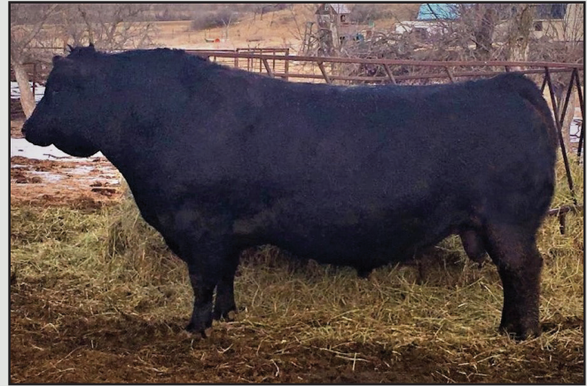
A C COLEMAN CHARLO 60 | AAA# 18729011