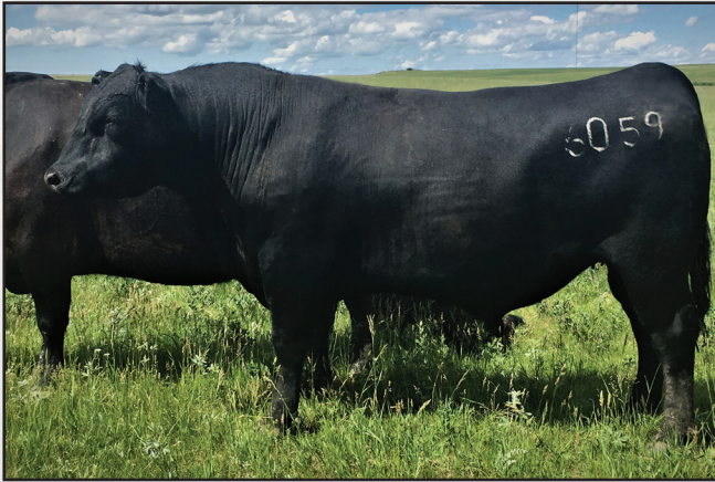
BEST TRACKER 6059 | AAA# 18701721