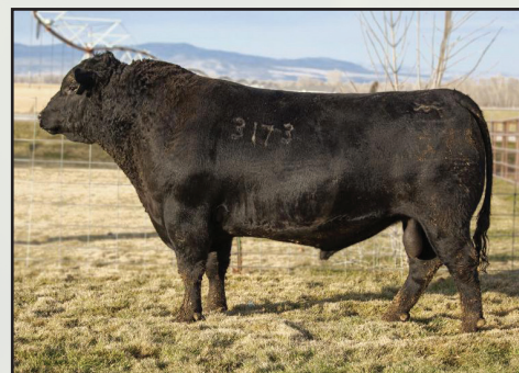
SVR REVOLUTION 3173 | Reg #18007495